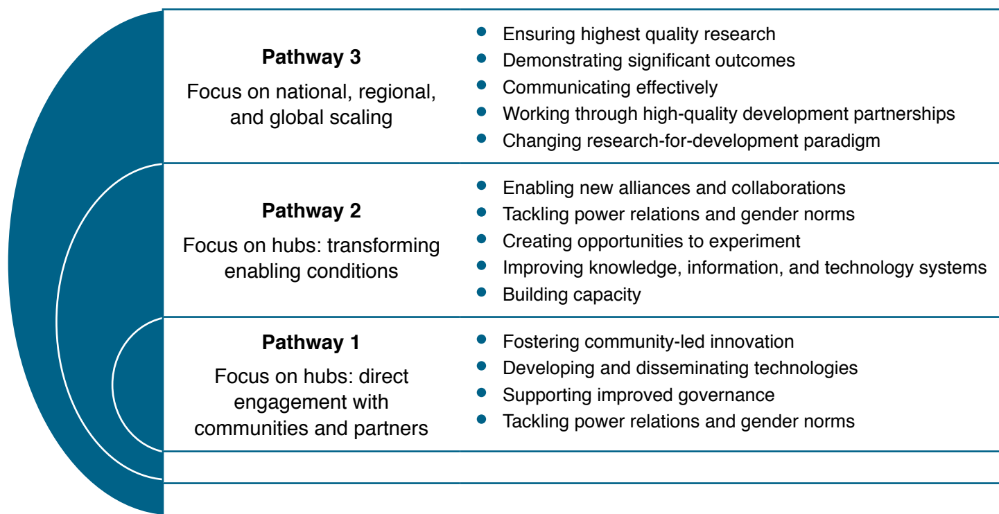
Figure 1: The three AAS scaling pathways.

The AAS program utilizes an ecological approach through its “scaling pathways” model (see Figure 1). For example, in Pathway 1, the program uses participatory action research (PAR) to foster a host of agricultural