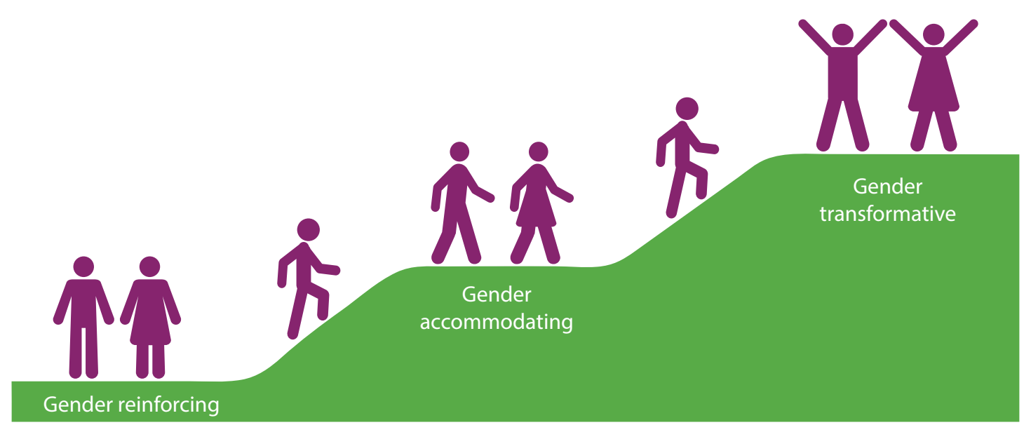
Figure 1. The way in which organizations and initiatives consider and work with gender can be viewed on a spectrum (adapted from the Gender Equality Continuum [5]) and highlights there are opportunities and actions that organizations and initiatives can take to move toward more accommodating and transformative approaches.

approaches. Together these cover initiatives designed to understand, take into account and respond to existing gender norms and power relations. As described below, best practice involves ensuring, as much as possible, that initiatives are structured toward at least the accommodative and, ideally, the transformative end of this spectrum. This is because development experience has shown that operating in this portion of the gender spectrum enhances development outcomes, not only for gender equality and women's empowerment, but also in relation to poverty and food security.