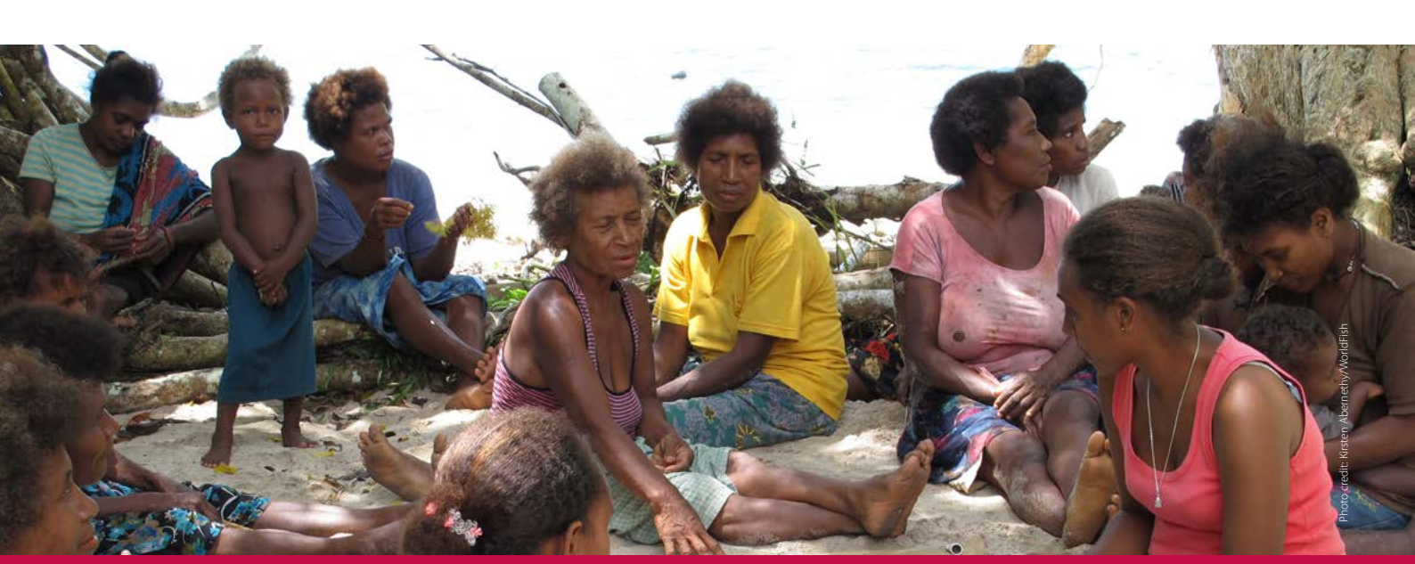
A facilitated discussion with women about local knowledge of fisheries and marine resources, Central Province, Solomon Islands.