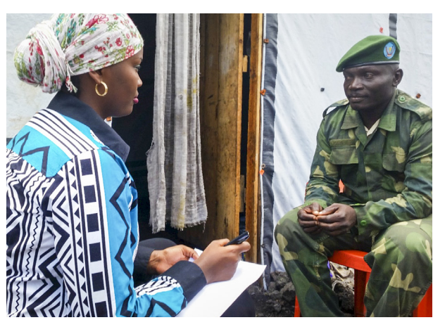
Interview with Living Peace participant from the military and father of 5, military camp, DRC.